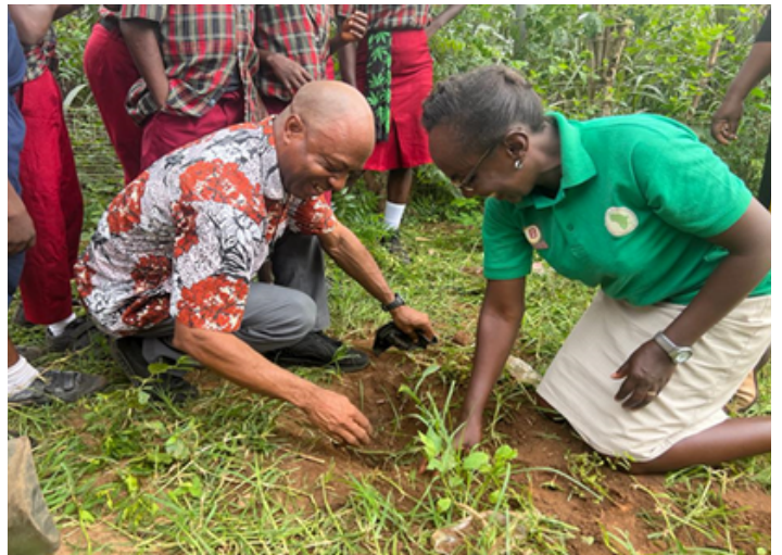
Picture showing the tree planting exercises