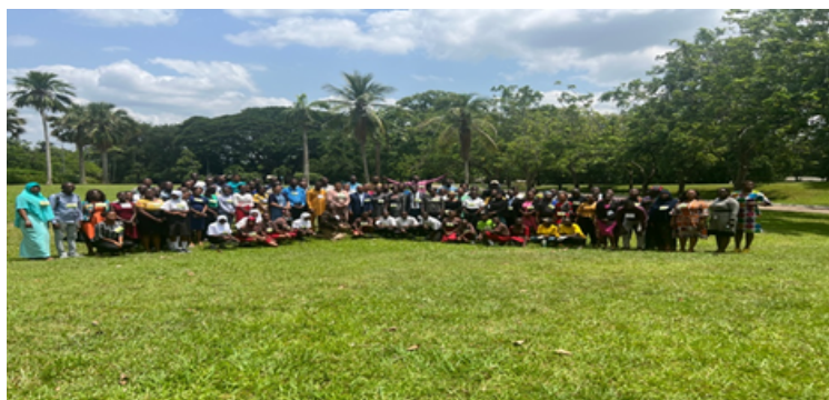
Participants from the 4th Annual Circularity Africa Conference

These webinars had a combined attendance of 240 participants from around Africa and beyond.