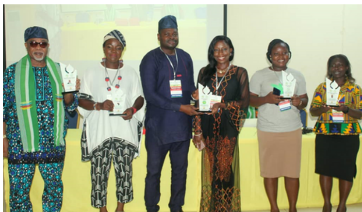
Winners from the IMAGES