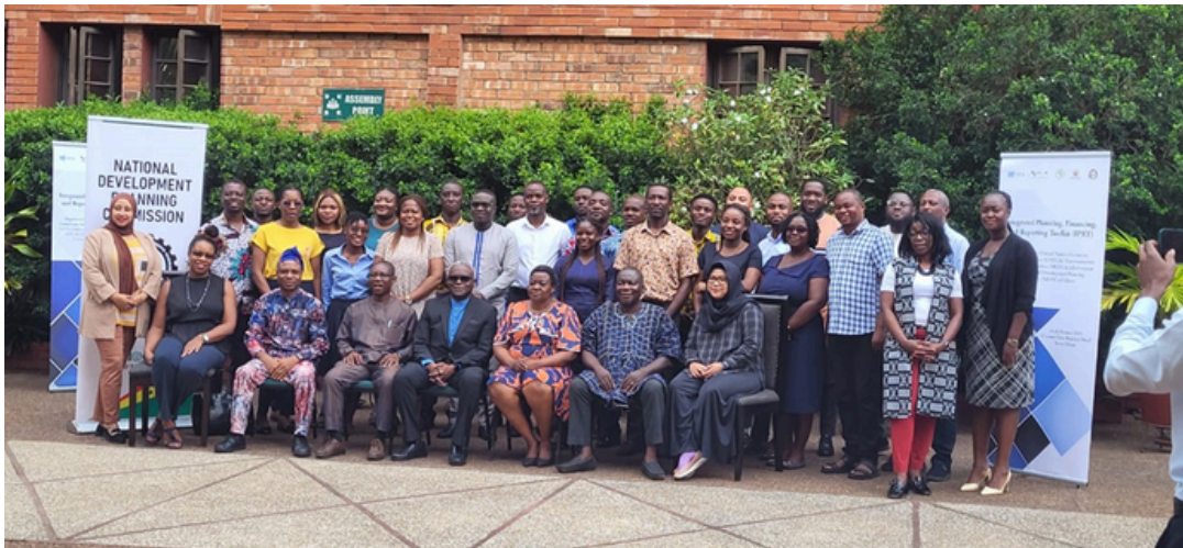
Training workshop on Integrated Planning and Reporting Toolkit (IPRT) in Ghana