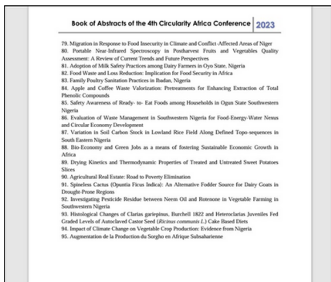
Picture showing total number of abstracts submitted at the 4th Annual Circularity Africa Conference