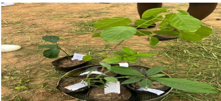
Picture showing different Species of Trees to be planted