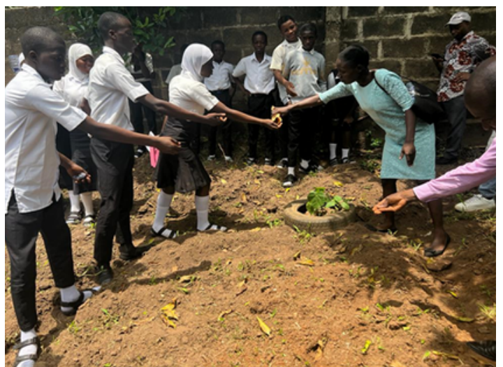
Picture showing the garden planting exercise on vegetable beds