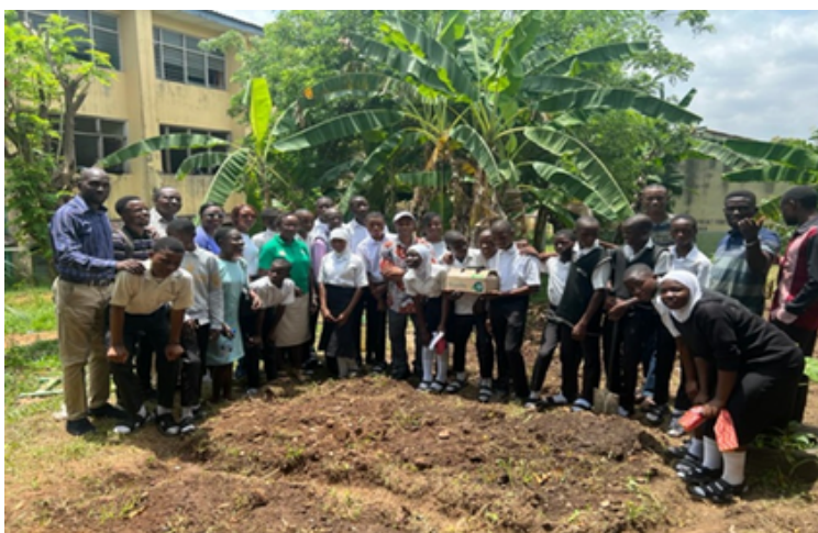
Pictures of Trees and garden planting exercise at Abadina Grammar School and Abadina College situated at the University of Ibadan, Oyo State.