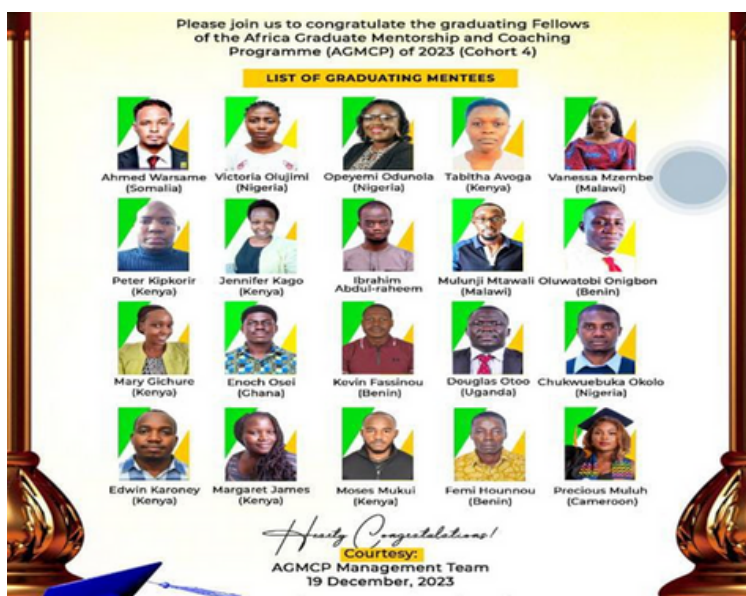
Graduates of the Africa Graduate Mentorship and Coaching Programme (AGMCP)