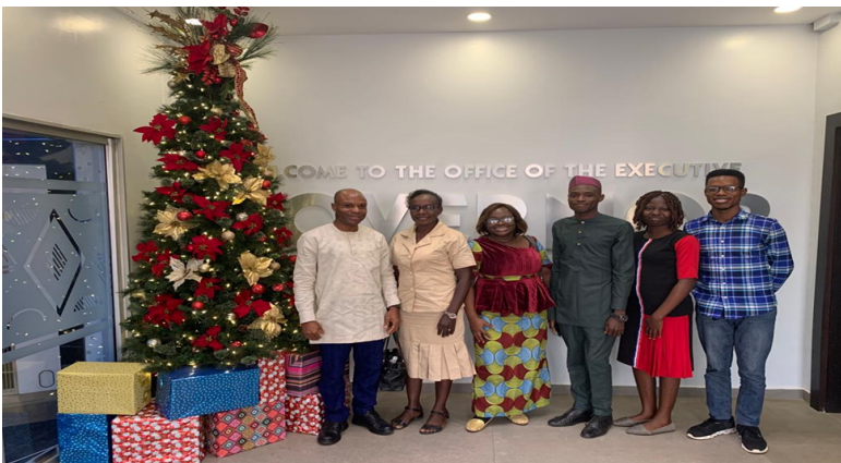
Some IMAGES Initiative Team members