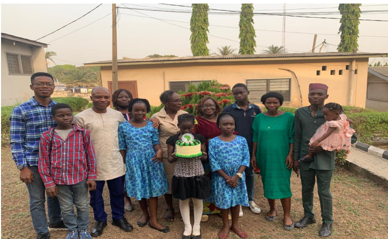
End of the year felicitations with some of the team members and their family members