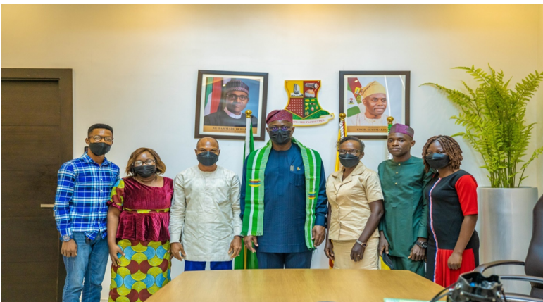
Team members of IMAGES initiative with the Executive Governor of Oyo state